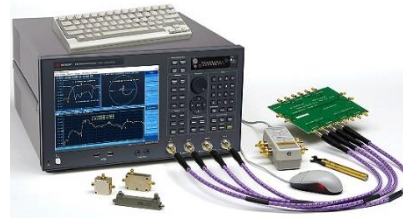
(Sample image, Keysight)